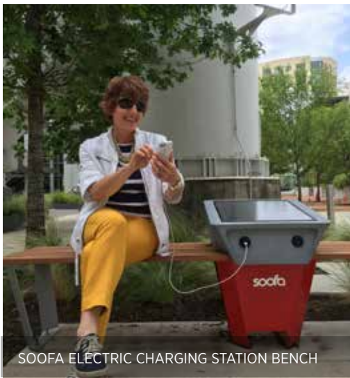
SOOFA ELECTRIC CHARGING STATION BENCH