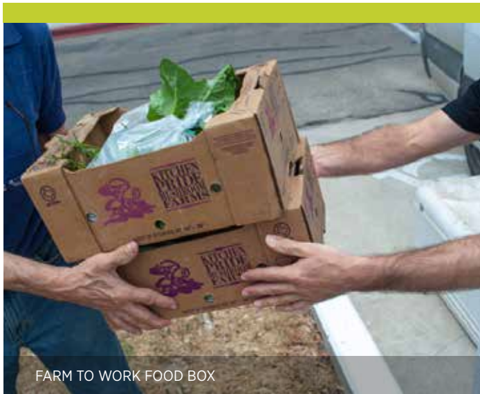
FARM TO WORK FOOD BOX