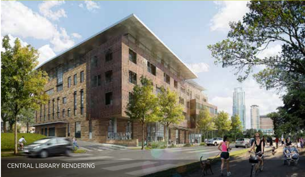
CENTRAL LIBRARY RENDERING