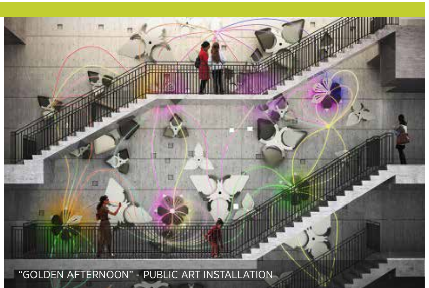
"GOLDEN AFTERNOON" - PUBLIC ART INSTALLATION