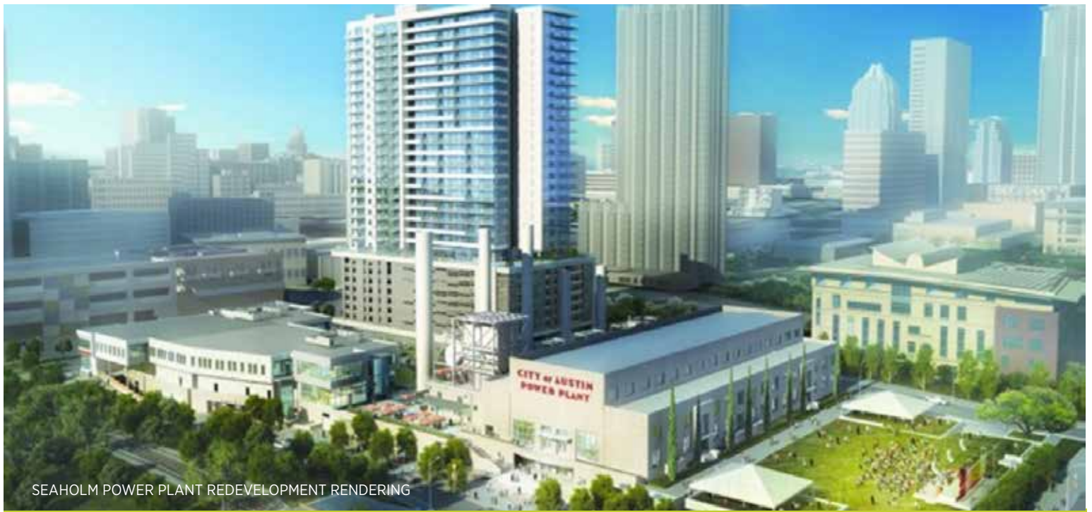
SEAHOLM POWER PLANT REDEVELOPMENT RENDERING