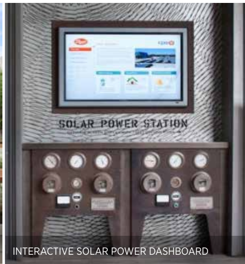
INTERACTIVE SOLAR POWER DASHBOARD